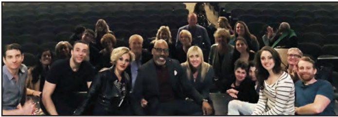
NYWBA members and guests—a group of smart, strong, funny, fierce, bold, and pretty women—see the hit new Broadway musical “Pretty Woman: The Musical”!