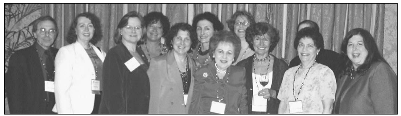
NYWBA Members enjoy the Awards Dinner at Convention!