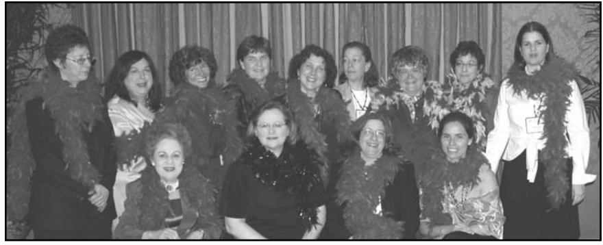
NYWBA Celebrates, New Orleans Style!

The convention was a huge success, thanks to the hard work and creativity of the 2004 WBASNY Convention Committee. The committee's efforts have inspired the 2005 WBASNY Convention Committee to launch plans for a convention at the Otesaga Resort Hotel in Cooperstown next May to conclude our year-long celebration of WBASNY's 25th Anniversary.