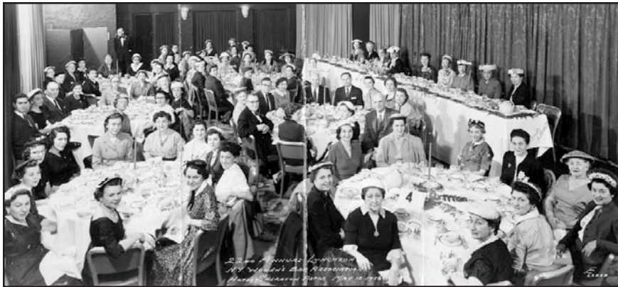
May 12, 1956 22nd Annual Luncheon, New York Women's Bar Association