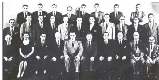
Attorneys in U.S. Attorney's Office, Southern District of New York (1952)

In 1943, she became an Assistant United States Attorney for the Southern District of New York. She was the first female federal prosecutor New York, and one of the first in the country. During her nine years with the U.S. Attorney's Office, she handled a wide variety of civil and criminal matters, including prosecutions for illegal attempts to profiteer during the war, mail fraud cases involving defective products sold across state lines, insurance fraud prosecutions, counterfeiting, etc.